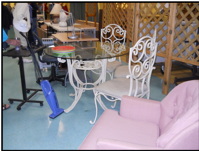
Auction articles waiting for the first bid