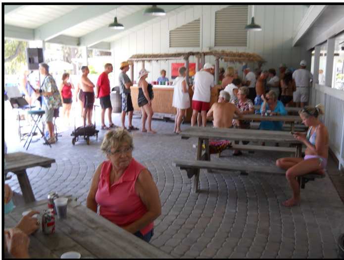
Guests line up to take advantage of the goodies served at the pool party

Well here we are again at the end of the season. Things are beginning to wind down, but not before one very busy month!