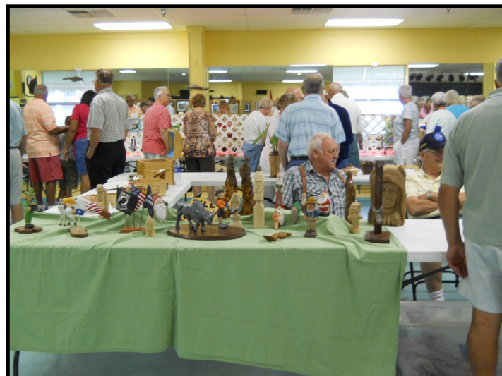
Wood Carvings on display at the Craft Fair

Everyone can participate. Classes are open to anyone who would like to learn...or teach. If you have a favorite craft and wish you could see it get started, post a notice on the bulletin boards, and who knows? There might be others wishing the same thing. It's that easy.