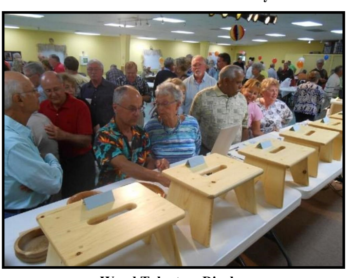
Wood Talent on Display