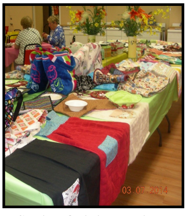
Sewing Quilting Projects

Hosting of this annual luncheon alternates between Royal Coachman Resort and Sun-N-Fun. It is one of the highlights of our season.