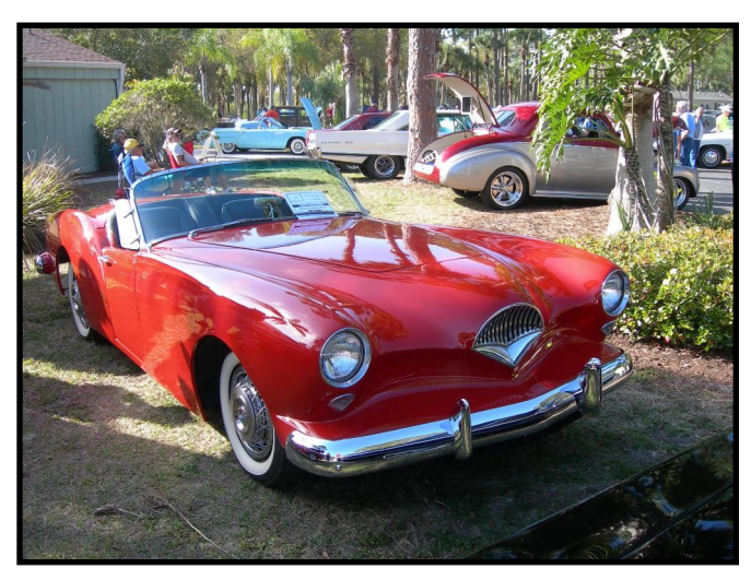
1954 Kaiser Darrin

This season's car show can only be described as a complete success. The outstanding weather contributed to the large crowds and the high number of cars entered. By noon there were display and visitor cars parked in every available spot. At the last count there were 71 cars registered ranging from a 1914 Model T Ford to a 1999 Chevrolet Corvette convertible. Included in the show were vehicle from all generations plus a scattering of British sports cars. There were some very pedestrian vehicles to those on the edge of design such as the 1954 Kaiser Darrin roadster. There was even your father's Oldsmobile. Ron Cournoyer can be justly proud of the excellent event he and his staff provided. As successful as the car show, the food sales were equally impressive. A combination of almost 800 hamburgers and hot dogs were sold.