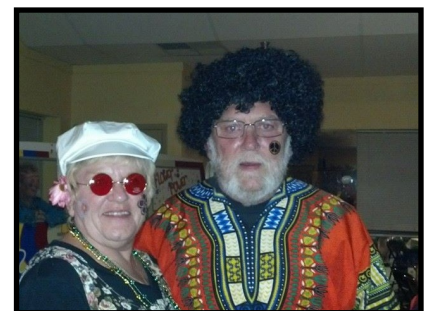
Who Are These Hippies?