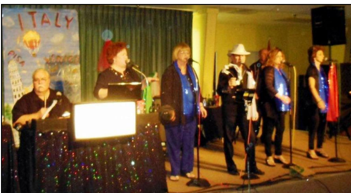
"Heart and Soul"

The Italian Fest was its usual sell-out. The wonderful chicken Parmesan, ziti and salad, catered by Angelo's Italian Market was topped off with a crowd pleasing spumoni dessert provided by Bentley's Ice Cream.