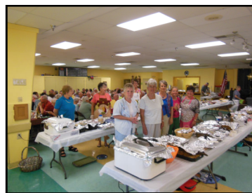
OK Folks, Come & Get It.