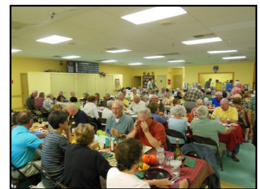
Half of 260 Well Fed Souls!

In November the Thanksgiving Dinner was another well attended event with turkey, stuffing and all the trimmings anyone would want. 260 Residents and guests attended. The Big/Brother Big/Sister Party took place to start everyone off with the holiday spirit. Again another wonderful event and giving back to the community from the residents' hard work at RCR. Most of the activities have returned and are in full swing for the upcoming season. Card playing, bocce, bingo and the tennis courts are full. The list goes on and on.