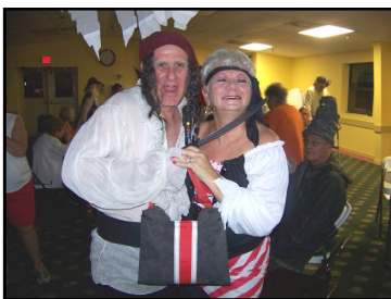
Arrgh! Avast there mateys.