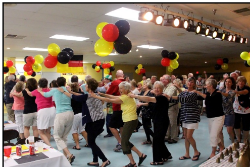
Conga All Night

Believe it or not, there was some beer left over, which suggests that we are getting older and watching our alcohol consumption, or simply that we were too busy dancing and watching the Alpine Express perform. As promised, it was a memorable night.