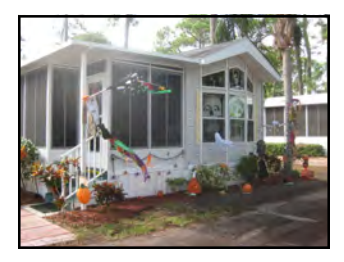
Halloween at Tarnowskis'

Are you ready for the new season? It promises to be one of the best!