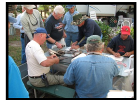
Cleaning the Catch