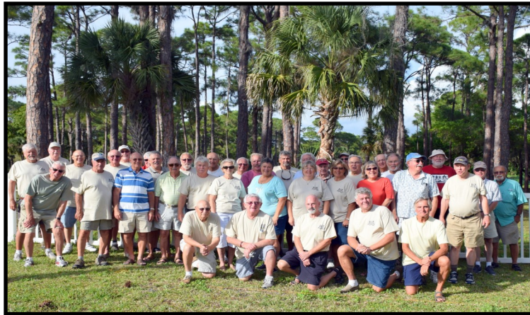
Royal Coachman Resort Anglers' Club 2015