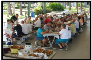
Enjoying the Feast